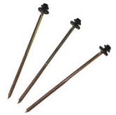
150mm Coated Tex Screws

445mm in length, the WESTLAND capped angle universal clay ridge is suitable for both slate and tiled roofs where a dry fix system is preferred.